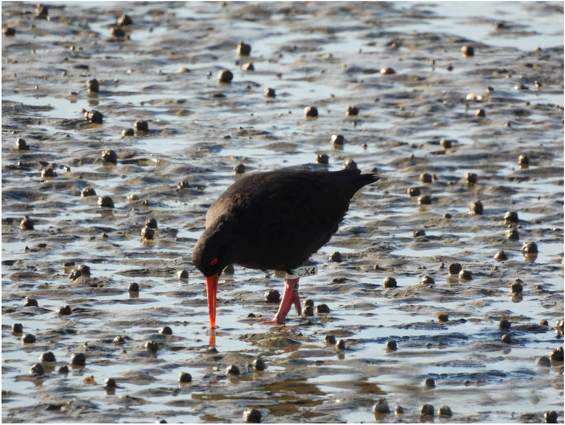
2. Tōrea pango family feeding at the shellbank