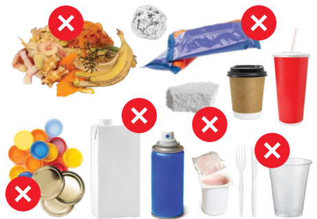
Food scraps, aluminium foil, soft plastics, takeaway cups, polystyrene, lids of any type, liquid cartons, aerosol cans, plastics numbered 3, 4, 6, 7,