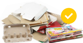
Clean, flat paper, cardboard, magazines, pizza boxes and egg cartons